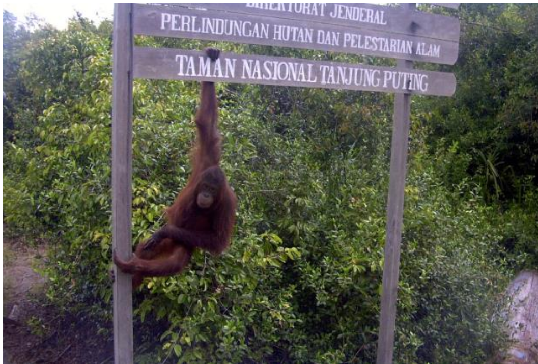
An orangutan in Tanjung Puting National Park.

( Muntiacus muntjak ), Sambar deers ( Cervus unicolor ), and many kinds of birds, including hornbills. In February we found one dead male orangutan who we suspect was killed in a fight with another animal.