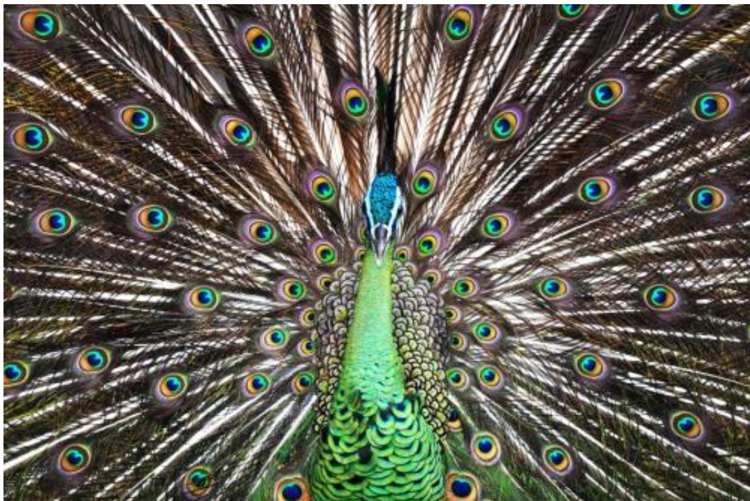
One of two endangered Javan peacocks we are currently caring for at the rescue center.

One male and two females arrived in July, all are good candidates for release but first we need approval to do this.