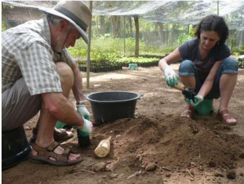
Some of our volunteers at work in our tree nursery.

The volunteering program, which began in 2011, has brought hundreds of new people to the island and continues to enjoy increasing support from both those who volunteer and the local community.