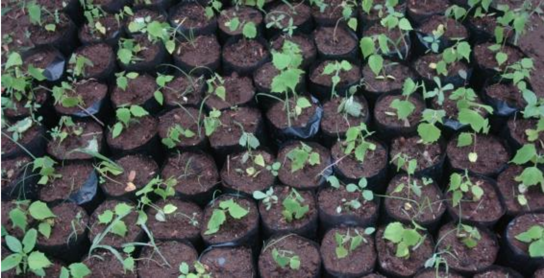
Some of the thousands of seedlings growing in our nurseries in Tanjung Puting National Park.

At our nurseries we collect and grow seeds and seedlings from the forest, fill polybags, as well as do transplanting and monitoring. Between Tanjung Puting National Park and Lamandau Reserve FNPF runs seven nurseries.