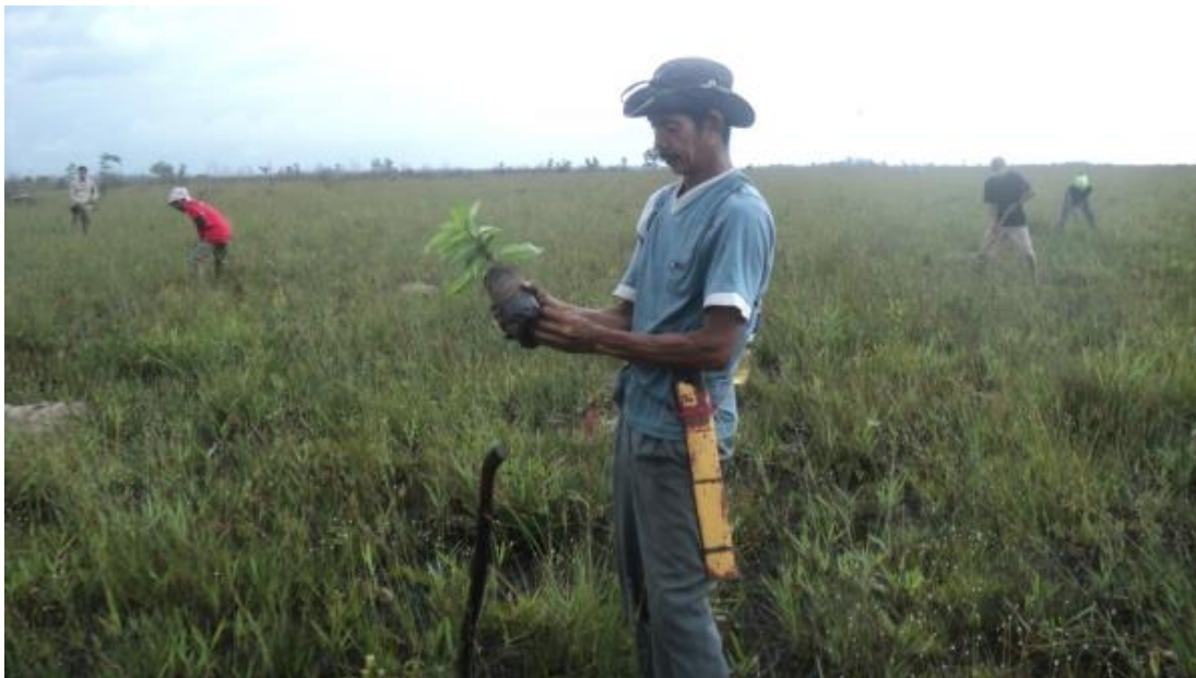
Planting saplings in Lamandau River Wildlife Reserve.

By the beginning of 2012, with the help of Sungai Pasir villagers, we had at least 141,250 seedlings in our nursery and had planted 29,250 trees. Cultivated and planted tree species included Ubar ( Syzygium sp.), Belangeran ( Shorea belangerans ), and Pelawan ( Tristania obovata ).