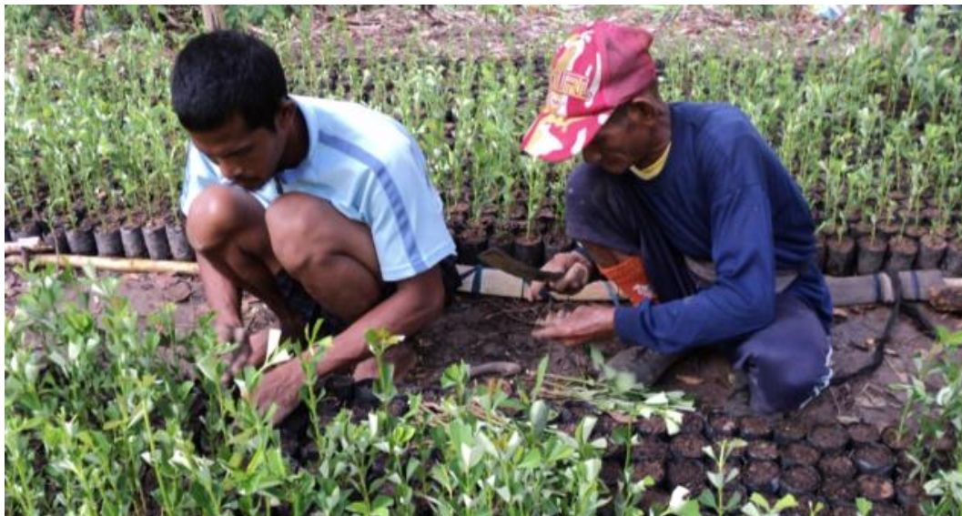
Some of the members of the Sekonyer Lestari agroforestry cooperative.

In Sei Sekonyer we are encouraging the villagers to engage in activities that can provide them with alternative incomes, and to also take part in conservation efforts.