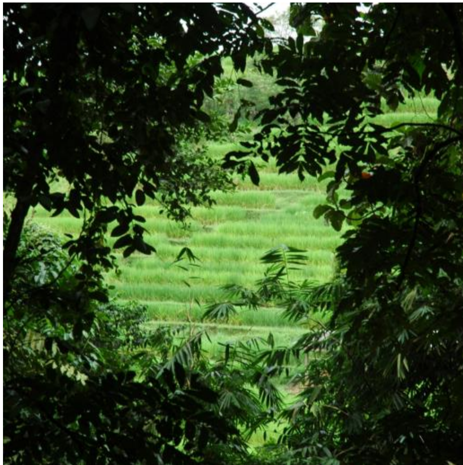
A view of the forest and rice fields within the Besikalung Wildlife Sanctuary.

We hope the sanctuary will also bring benefits to the local community who support the program.