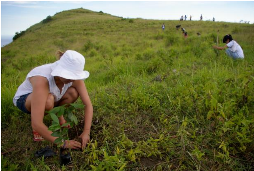
FNPF volunteers and local community members planting trees to help restore the forest on Bali's Nusa Penida island.

While we are no longer directly involved in the rehabilitation and release of orangutans – following the introduction of government regulations prohibiting the release of this species into areas where orangutans were already living – we still monitor their numbers and are working to rebuild their habitat. It is distressing, for us all, that the number of wild orangutans and other wildlife we are able to spot within Kalimantan's Tanjung Puting National Park and Lamandau River Wildlife Reserve continues to decline, and that the rapid destruction of the forest within these areas carries on unabated.