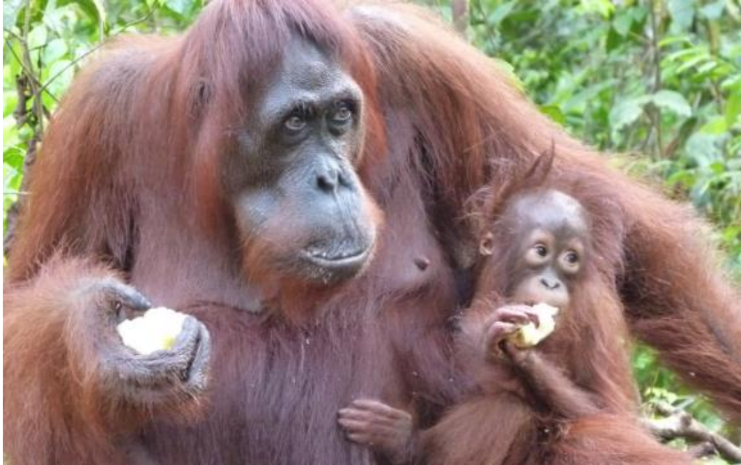
Orangutans spotted in Tanjung Puting National Park in Kalimantan, on the island of Borneo.

can learn about these important issues and what can be done to save our endangered wildlife in Indonesia.