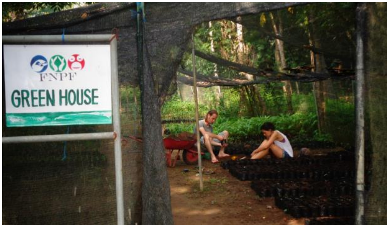
Volunteers helping out in our greenhouse and conservation center at Ped village on Nusa Penida island.

Most importantly, however, the volunteer program is a significant income stream allowing us to run other programs which have yet to find donors.