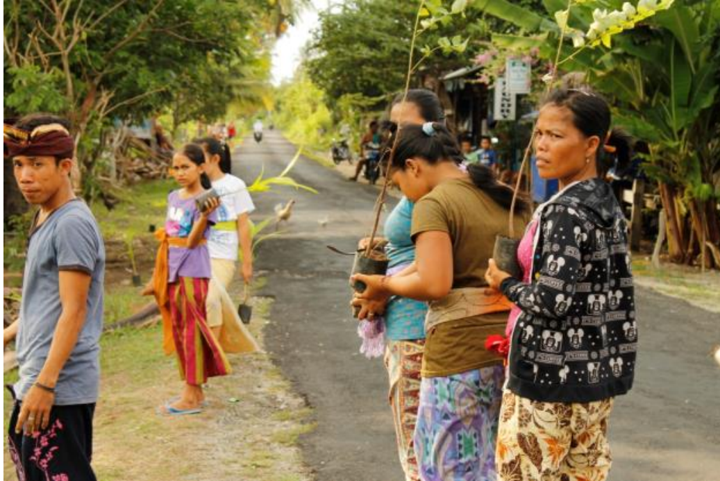
Community members on Nusa Penida planting trees from our nursery.

Among those who collected free saplings was a local youth organization, based near the FNPF center. The group planted 3,165 trees, including Jamaican cherry and palms, along the road. We are continually encouraging people to plant trees for various reasons – considering most of the island is covered in grass, we believe whatever trees are planted will improve the quality of the environment on Nusa Penida.