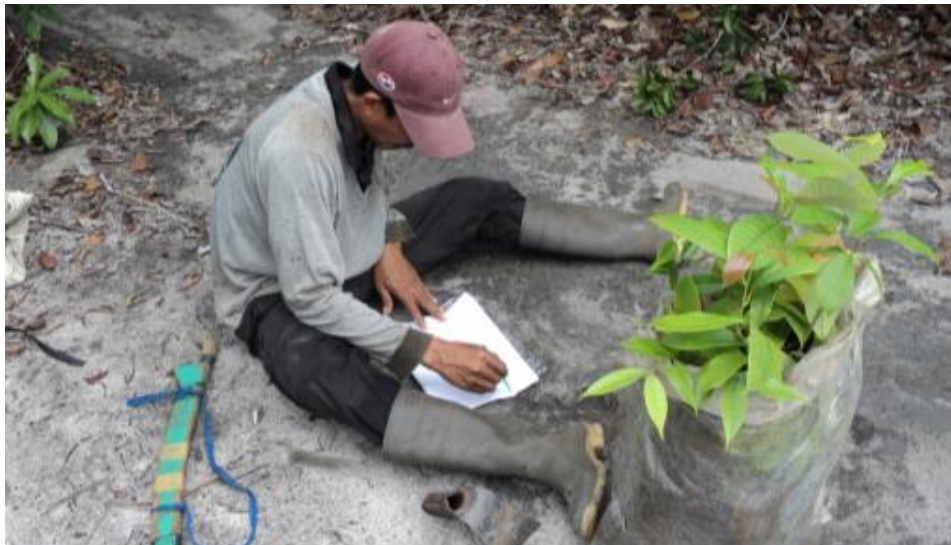
An FPNF worker with seedlings ready to plant in Tanjung Puting National Park.

FPNF would not be able to do our work in Kalimantan without the generous backing of the Humane Society International (Australia) who has supported us for more than 14 years, along with the Boeing Corporation, Taronga Zoo Australia, Buy One Give One, and other donors. You too can support us by making a donation through our website, or donating equipment to help us in the field such as GPSs, cameras, fire extinguishers, rainwear, tents, hammocks, grafting knives, hoes, or gloves.