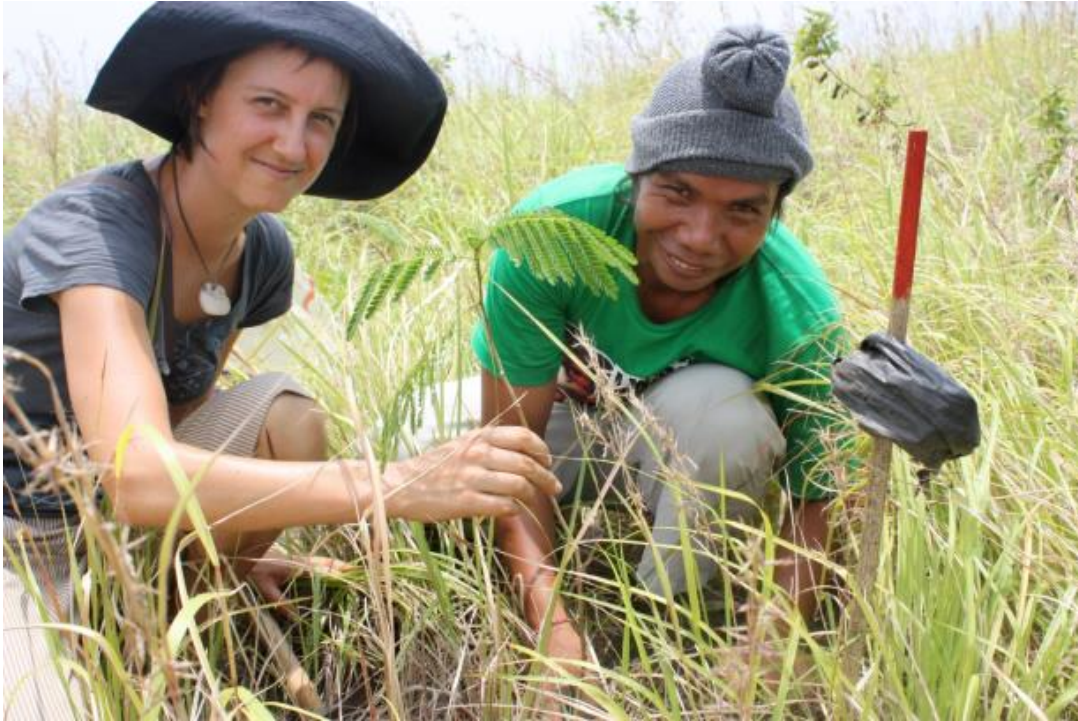
One of our volunteers and one of our Nusa Penida staff members planting trees.

Check out our website www.fnfpf.org for more information or email us at info@fnfpf.org . You can also follow us on Facebook – search for FNPF Bali – or on Twitter.