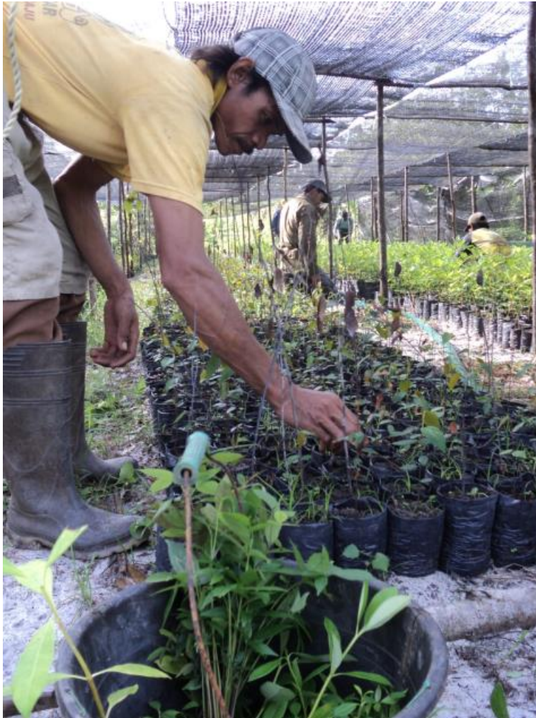
Tending to seedlings in one of our nurseries in Tanjung Puting National Park.