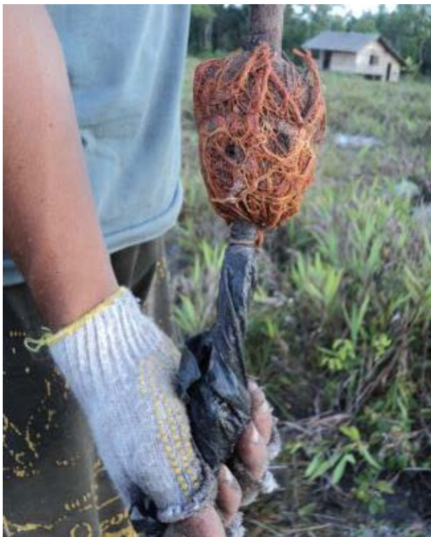
Ready for planting.

Our nurseries were looked after by six FNPf staff, one FNPf local volunteer, and about 14 people from the local village.