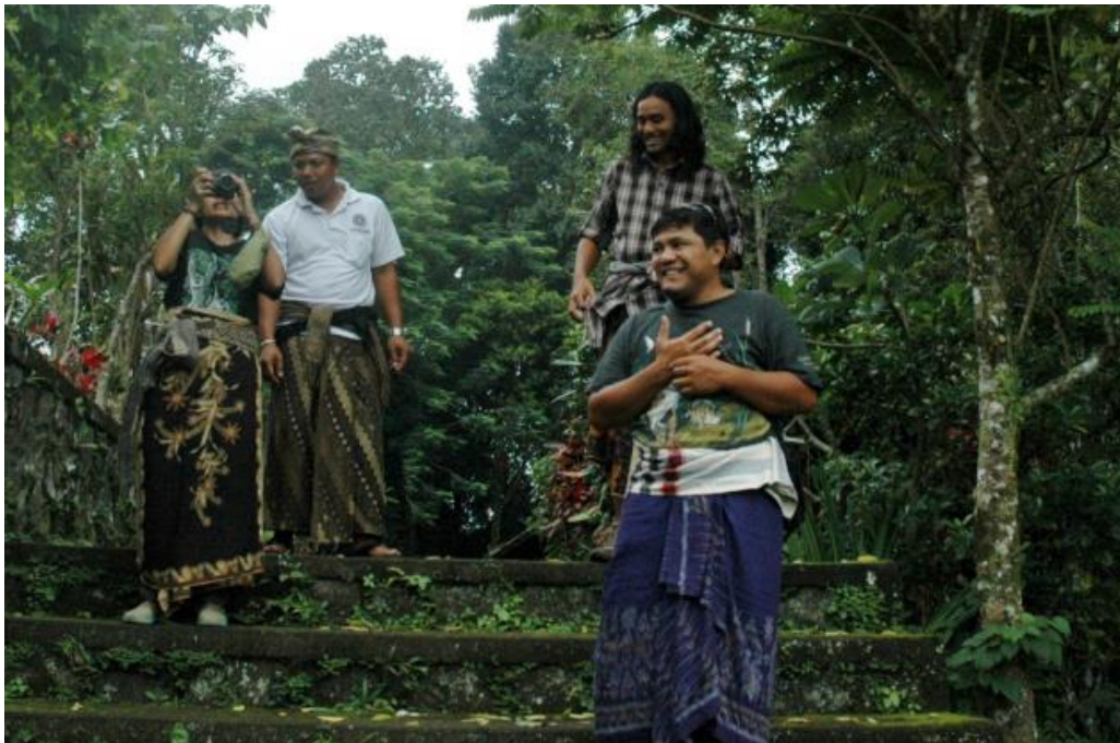
A FNPf team visit to Besikalung Wildlife Sanctuary.

We also need funds to finish building the sanctuary information center – work on which began in July 2012 – where the public can learn about conservation issues.