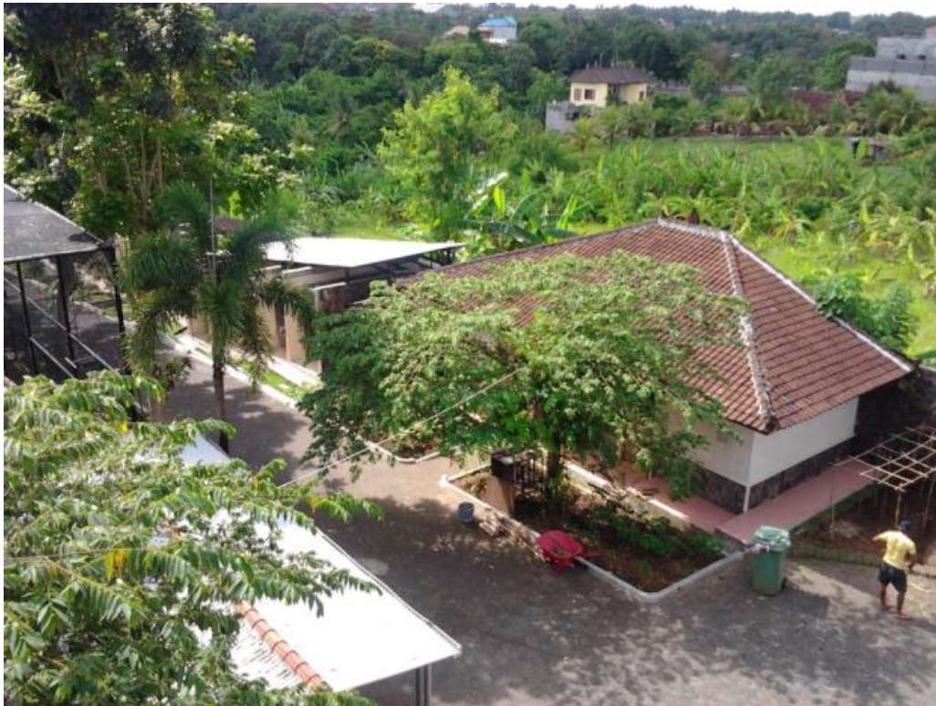
A view of part of our Bali Wildlife Rescue Centre in Tabanan.

Meanwhile, we continue to negotiate with authorities for permits to release into the wild those animals that are ready for a new home.