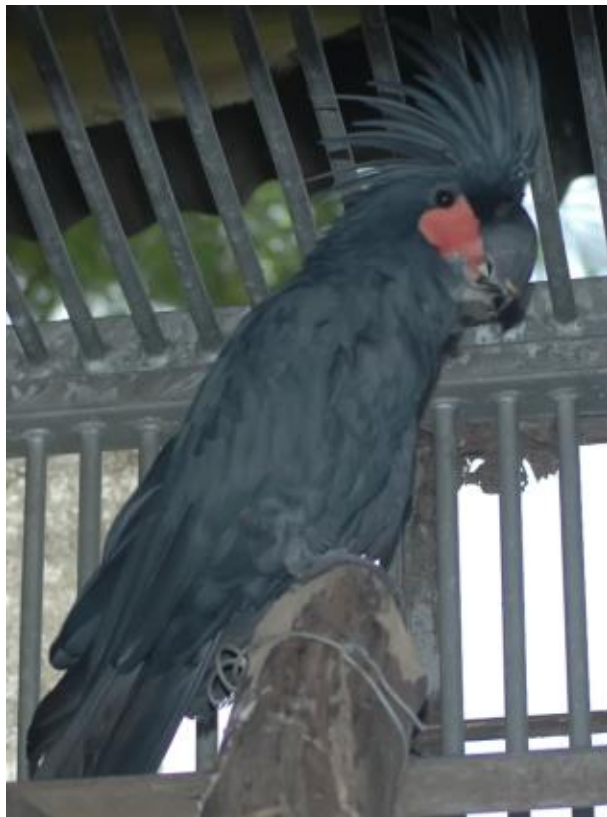
One of our Palm cockatoos.

All of these birds are doing well physically and show no signs of psychological problems. In June, we received a very stressed cockatoo which had been confiscated by BKSDA. We treated the bird but unfortunately it died within a few days of its arrival.