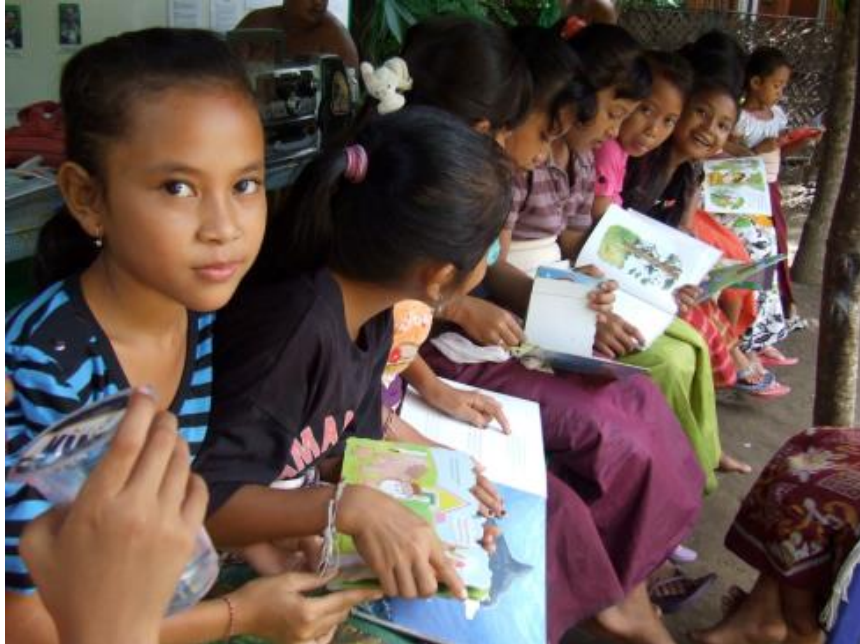
Nusa Penida youngsters reading books at our volunteer and conservation center in the village of Ped.