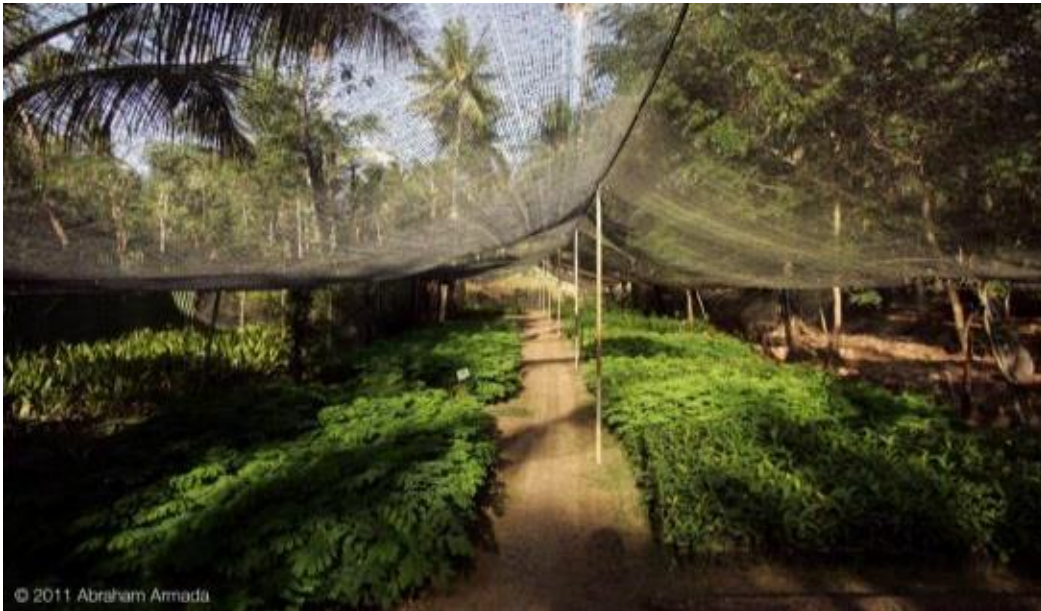
Our sapling nursery at our volunteer center in the village of Ped on Nusa Penida island.

Learning from our experiences at our reforestation site, the focus of our tree planting activity is now on agroforestry and we provide saplings of those trees that local communities like to plant on their land, or by the road sides.