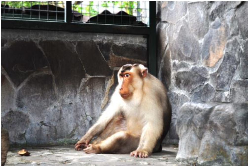
One of three Pig tailed macaques – this one goes by the name Moon – at our Tabanan center.