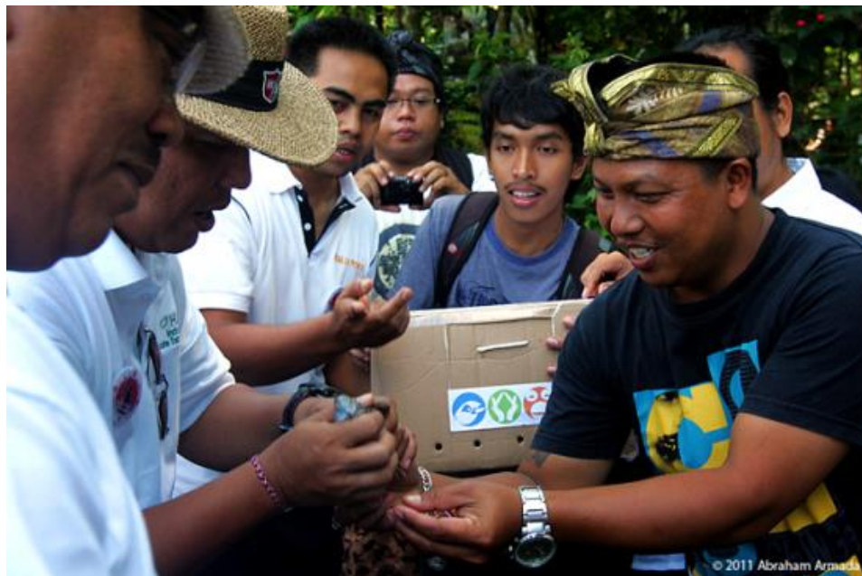
Releasing birds at the Besikalung Wildlife Sanctuary in November 2011.

Since the sanctuary was created in early 2011 we have released White vented mynahs and Peaceful doves into the forest under the protection of the local community.