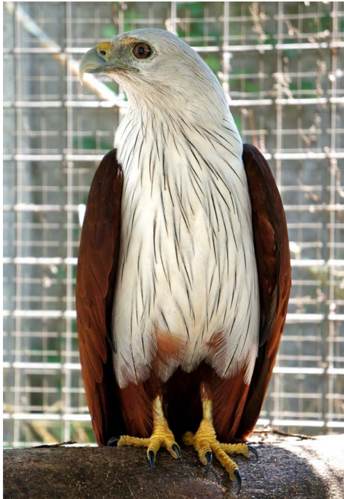
One of our Brahminy kites.

We received one confiscated bird from BKSDA in March, the bird was skinny and quite tame and not able to fly well. We suspected it was malnourished and had been chained for a long time. We received another confiscated bird in May, which was also skinny and had lost four of its nails.