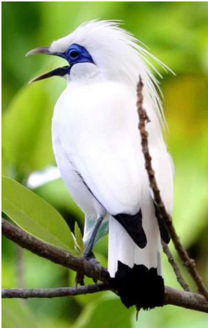
The endangered Bali starling.

During the year eight officers from the Department of Forestry's Bali Bureau of the Natural Resources Conservation Agency (BKSDA Bali) stayed at the FPNP center for four days. They wanted mostly to get some first-hand experience of our Nusa Penida conservation program – when the delegation left they expressed an interest in having more involvement in the project.