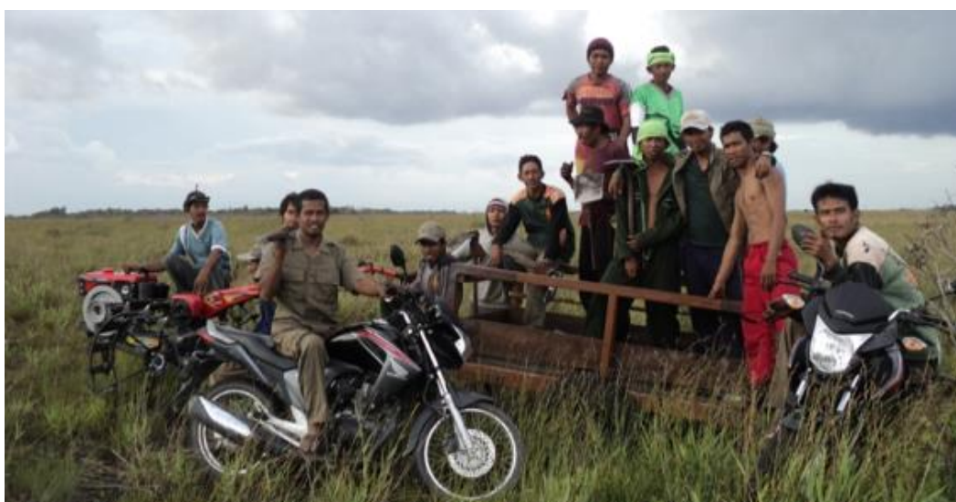
Some of our fantastic team of staff and volunteers in Kalimantan.