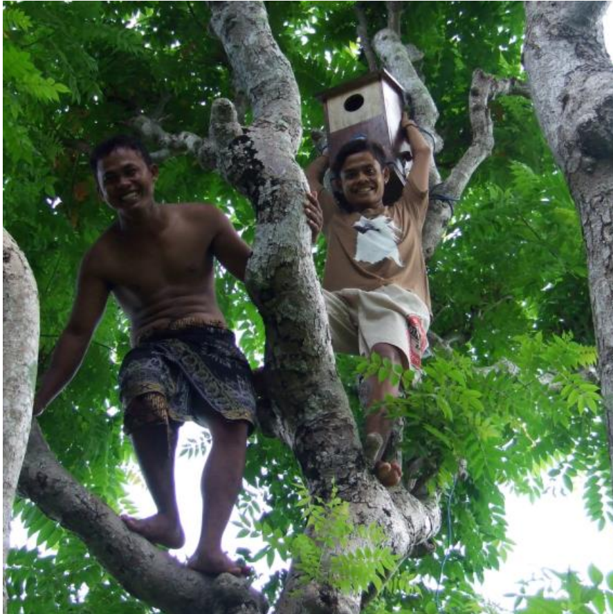
FNPF staff position a bird nest box in a tree on Nusa Penida island.

Observation of the Mitchell lorikeet ( Trichoglossus haematodus mitchellii ) population has become quite difficult as they venture much further from the release site. There are occasional sightings of these birds around the FNPF center..