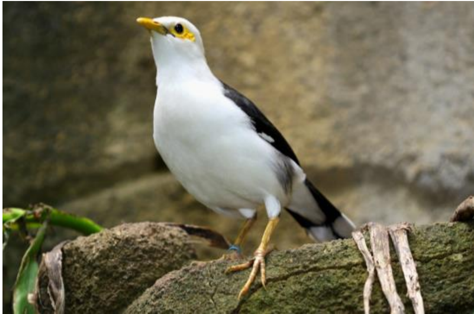
An endangered Black winged starling on Nusa Penida island.

Based on the findings it is estimated that there were at least 105 birds across both islands. This is an improvement on the previous year, when it was estimated that there were a minimum of 93 birds.