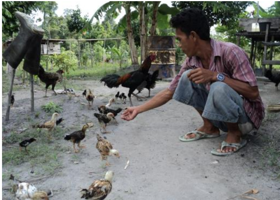
Teaching people to rear chickens is one of our alternative income projects.

Along with planting trees we also developed a livestock farm. So far we have raised six cows and 30 chickens, and four more cows were bought using donations and money made from selling vegetables grown on this plot. To ensure our cattle has enough food all year around we are growing elephant grass close to the cow pen.