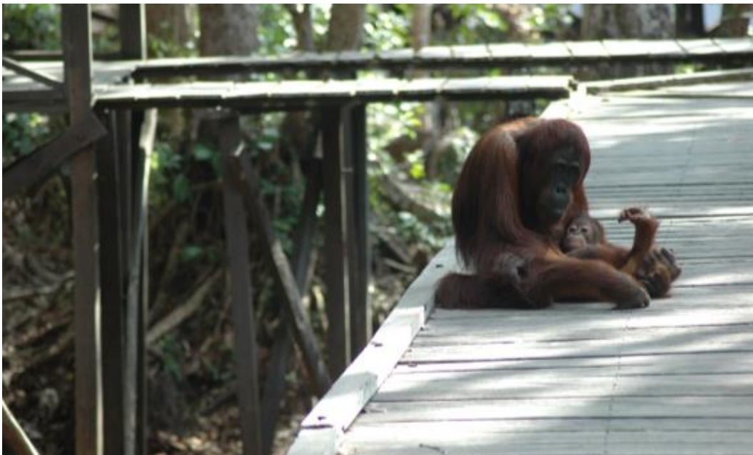
Orangutans in Tanjung Puting National Park.

Unfortunately, the rampant and unchecked destruction of the forests, found in Central Kalimantan, through legal and illegal logging, and the increase in massive palm oil plantations, has rapidly diminished their natural habitat.