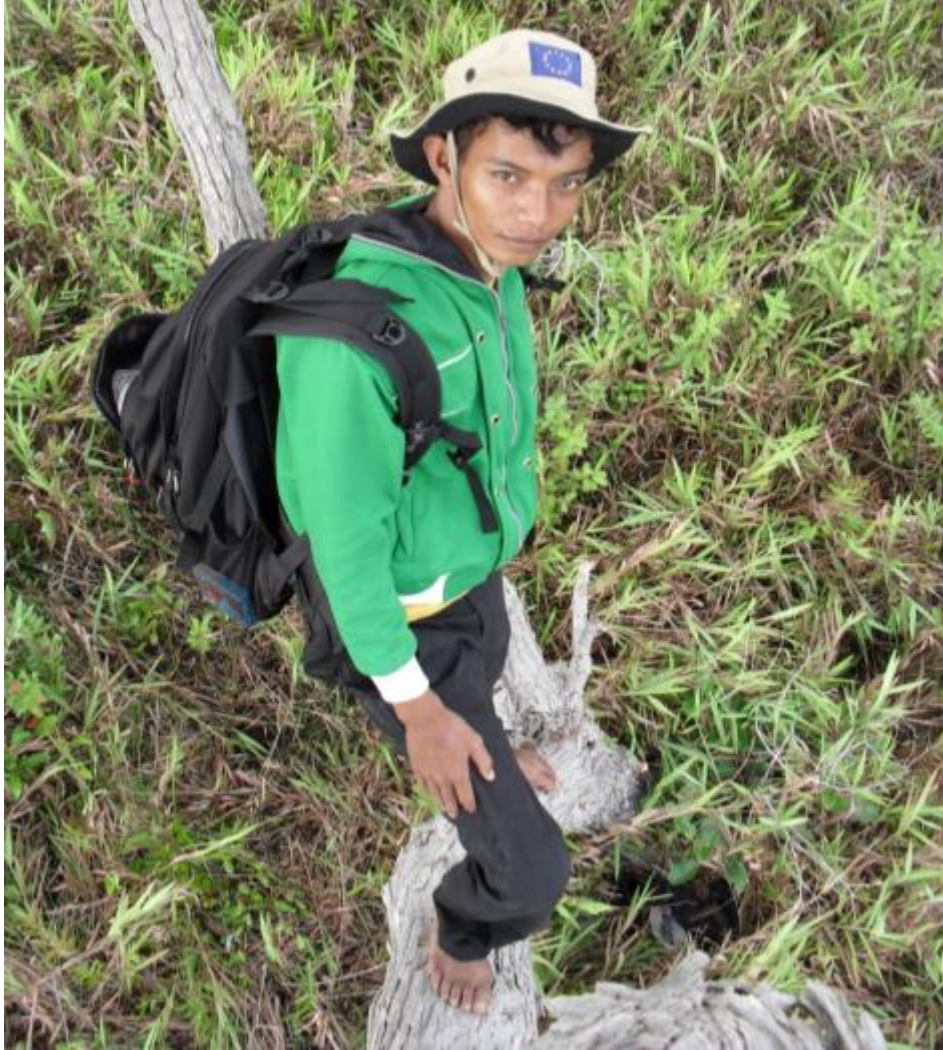
One of the Friends of the National Parks Foundation Kalimantan team.