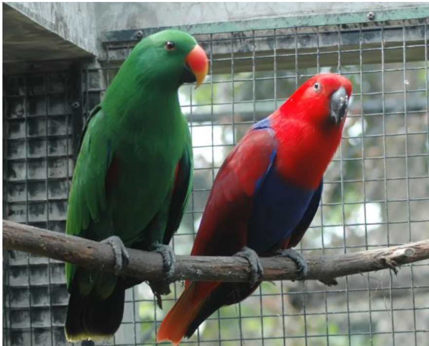
Two of the Red sided eclectus our Bali Wildlife Rescue Centre.

We had to isolate another of the birds for a few weeks. Right now all of the remaining birds are doing well.