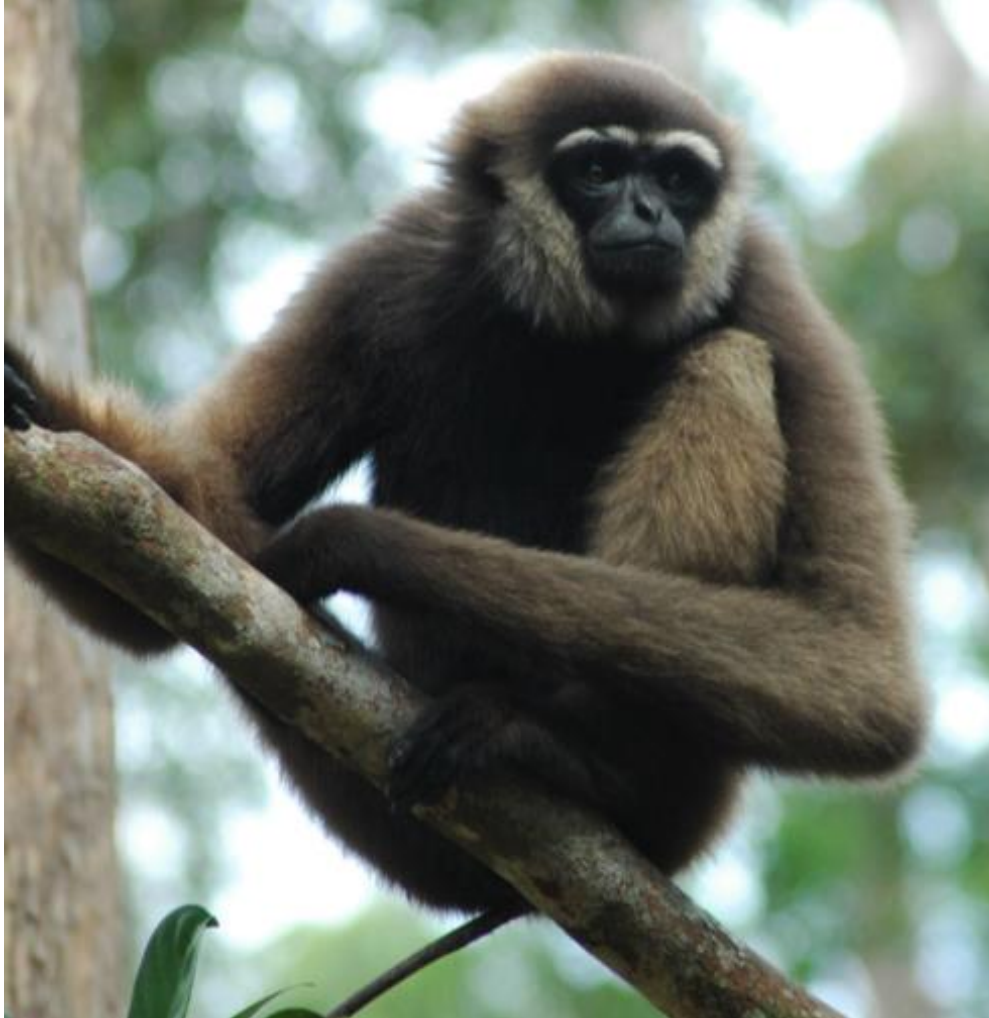
A gibbon in Tanjung Puting National Park.

Thank you to the Humane Society International (Australia) who have been supporting FNPF's holistic conservation projects since 1999, as well as Taronga Zoo and Boeing who also have been helping us over the last three years.