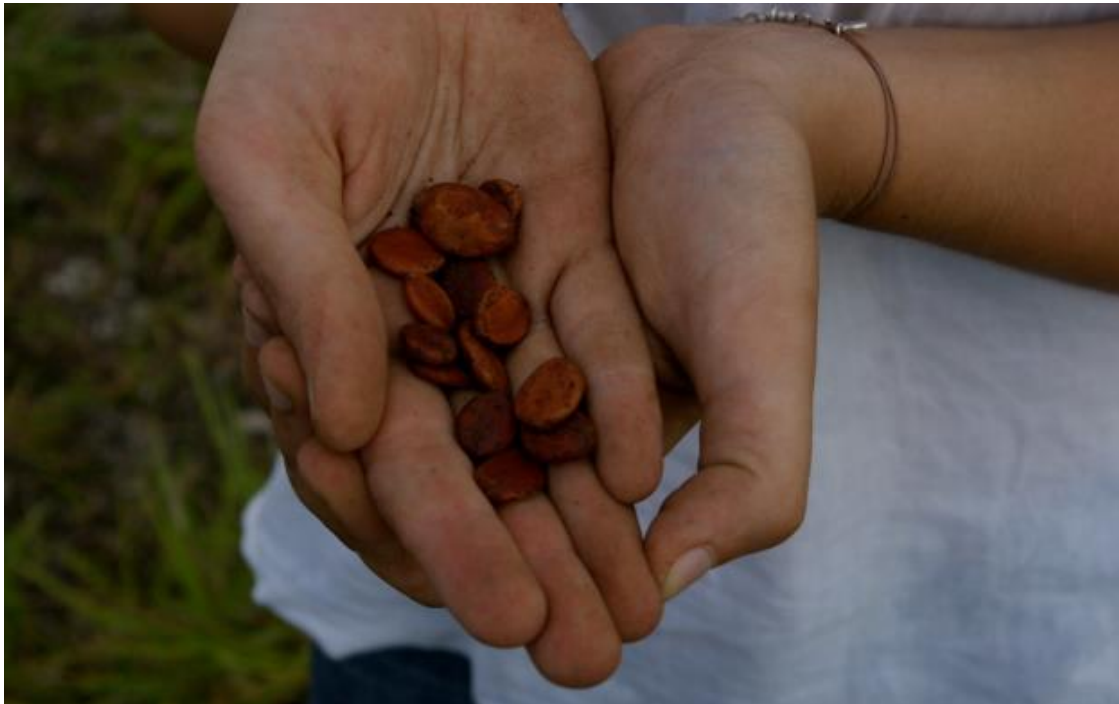
Seeds ready for planting.