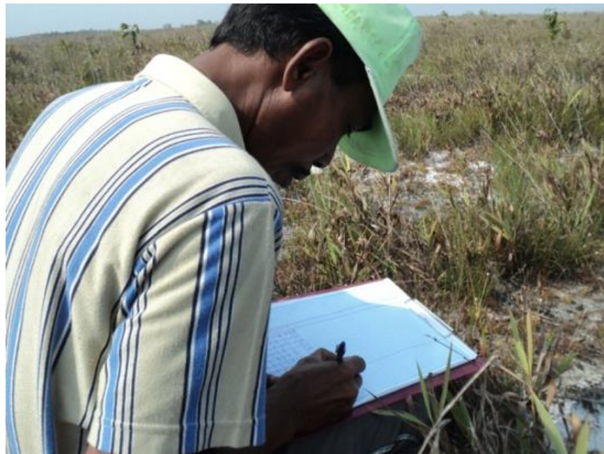
One of our staff members at work in the field in Lamandau River Wildlife Reserve.

Fruit doves 10 to 15 a day, Sea eagles at least once a month, kingfishers at least once a month, deers (we found a lot of footprints and the evidence of poaching activities), and other kinds of bird that like to spend their time in very open areas.